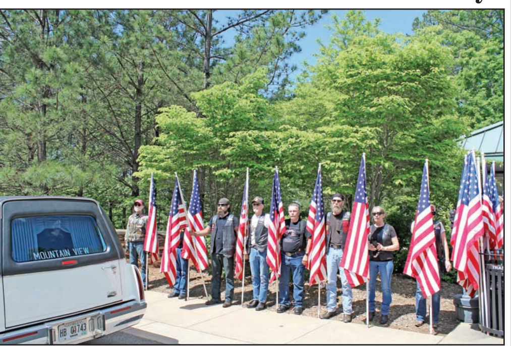
Veterans greet the five who were laid to rest at the Georgia National Cemetery in Canton on Wednesday, April 26.